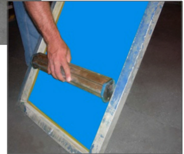
Step 2. Squeegee Side