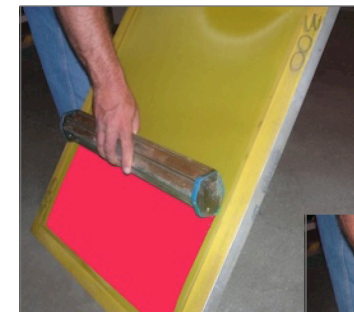
Step 1. Print Side

Note: Above times are based on using a screen coated 2/2.