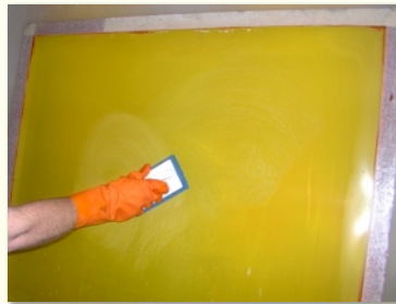
2. Scrub screen with non-abrasive pad or brush. Let dwell 1-2 minutes.