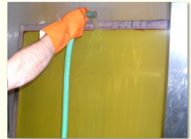
3. Flood rinse the screen starting at the top and washing all residue off the screen.

Look For More Information on all the Products in the ENVIROLINE® of "Green" Chemistry.