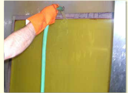
Step 3. Flood rinse the screen starting at the top and washing all residue off the screen.