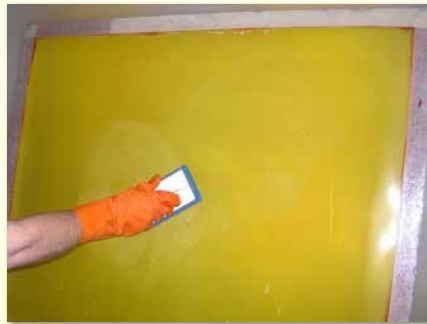
Step 2. Scrub screen with non-abrasive pad or brush.