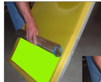
Step 1. Print Side

Note: Above times are based on using a screen coated 1/1.